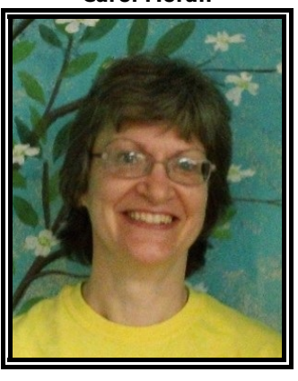
The Simple Joys of Grandparenting